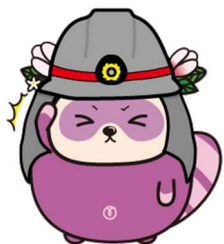
Mizuho Town Official Character Mizuhomaru